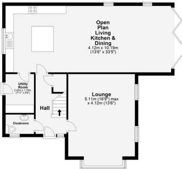
Ground Floor Approx. 78.7 sq. metres (847.6 sq. feet)