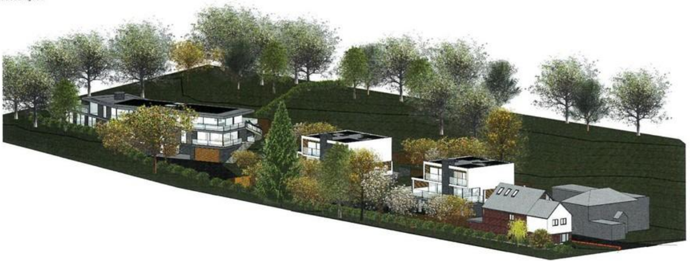
1 South East View

PLEASE NOTE: All dimensions to be checked on site by contractor. All dimensions in millimeters. Do not scale from drawing. Please check there have been no revisions to the drawing before starting work. All site levels to be confirmed on site before starting work.