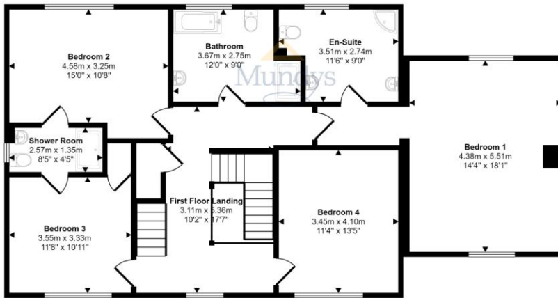
First Floor Approx 118 sq m / 1272 sq ft Denotes head height below 1.5m