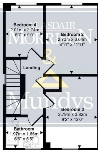
First Floor Approx 37 sq m / 402 sq ft