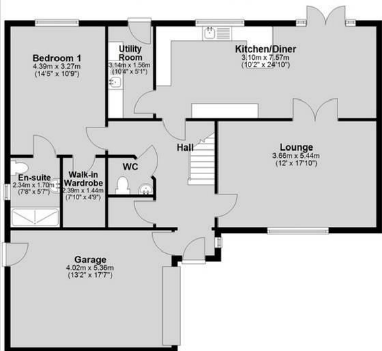
Ground Floor Approx. 109.8 sq. metres (1181.4 sq. feet)